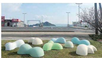
SHIMA