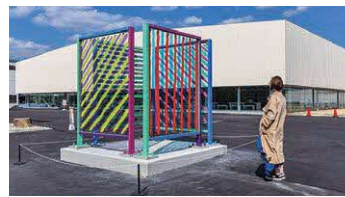
un14-2 NEW

Teppei Kaneuji "S.F. (Seaside Friction)" Passport required. No individual admission fee.